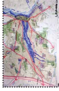
See the Scenarios board for more detail.

The CAC invited the City Council, Planning Commission and local design professionals to brainstorm land use concepts through maps, drawings and narrative.