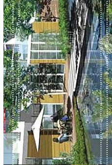
VANCOUVER British Columbia, Canada