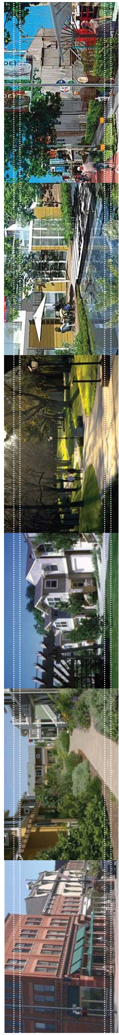
LODO Denver, Colorado