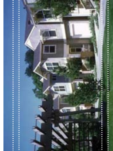
METRO SQUARE Sacramento, California