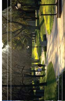
LOS ALTOS, California